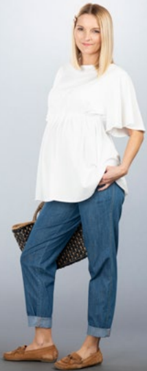
ROMA JEANS relaxed style