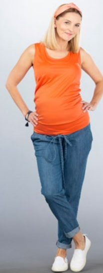
SEVILLA JEANS relaxed style