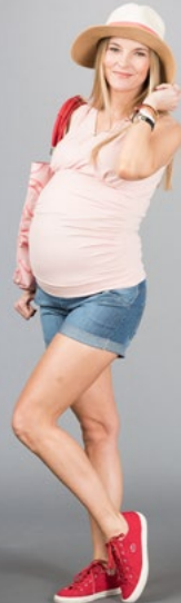
SORRENTO JEANS straight leg