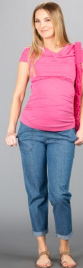
VERONA JEANS relaxed style