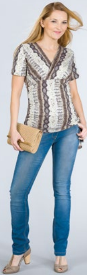
CALIFORNIA JEANS slim fit