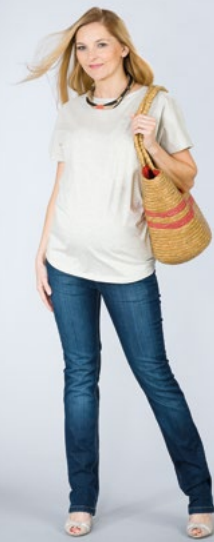
VENEZIA JEANS straight leg