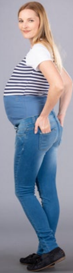
ALABAMA JEANS slim fit