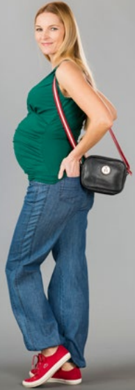
LEO JEANS relaxed style