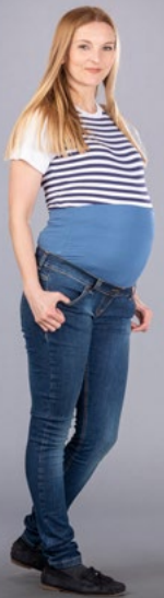
CALIFORNIA JEANS slim fit