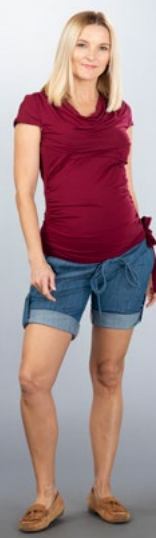
MALAGA JEANS relaxed style