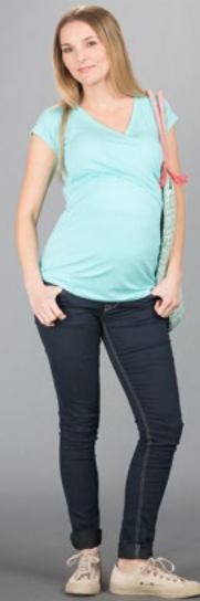
SKINNY JEANS slim fit