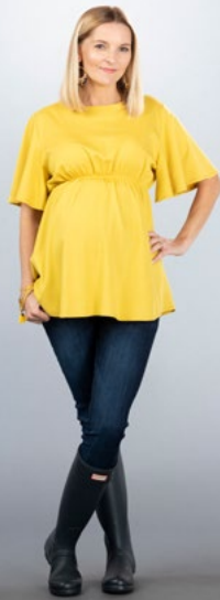
ORLANDO JEANS slim fit